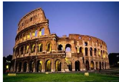
ROME W/VATICAN TOUR